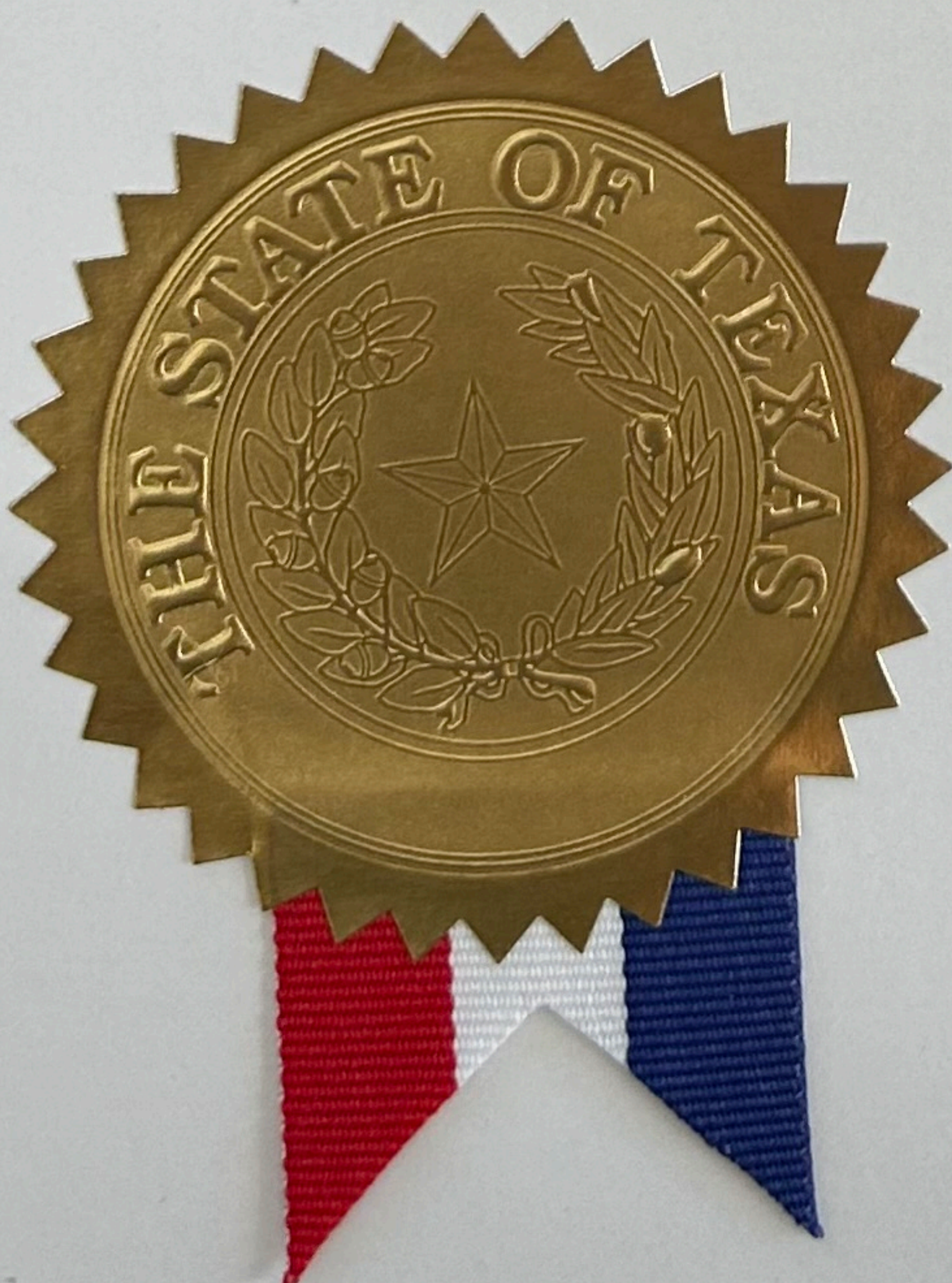
Greg Abbott Governor of Texas

In testimony whereof, I have signed my name and caused the Seal of the State of Texas to be affixed at the City of Austin this the 4th day of March, 2024.