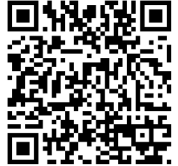
2024 Texas Notifiable Conditions List

The Texas Notifiable Conditions List , which identifies the conditions that must be reported to the DSHS, and their reporting time frames is available online here . Or scan the QR code at right.