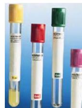
Gold top tubes or Lavender tubes