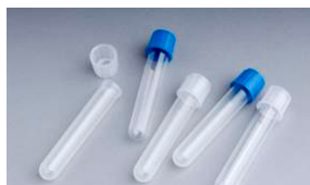
Transfer screw cap tubes