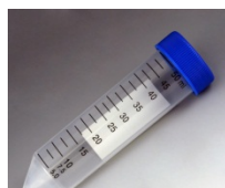
50ml Conical tube